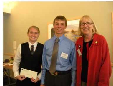
Pat Shoemaker Award Winners