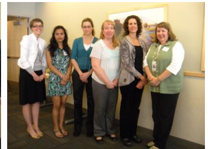
First Time Employee Recipients