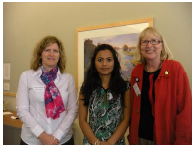
Betty Lue Hill Award Winners