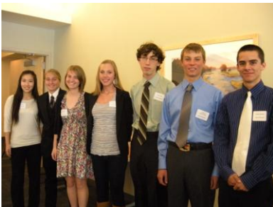
High School Recipients